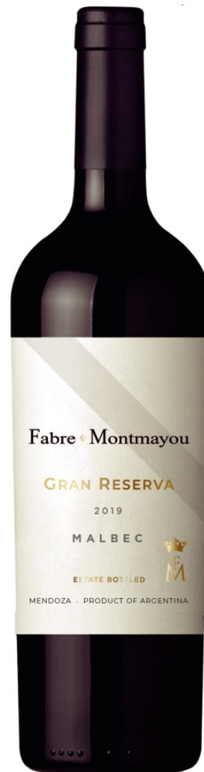
Gran Reserva Malbec