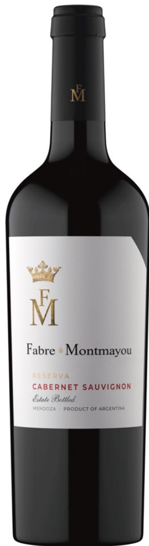
Reserva Cabernet Sauvignon