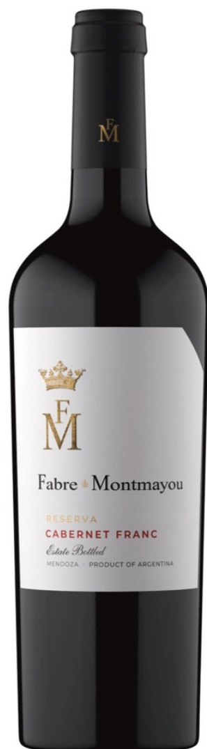
Reserva Cabernet Franc