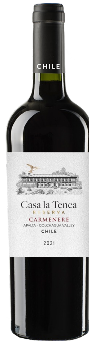
Casa La Tenca Carménère