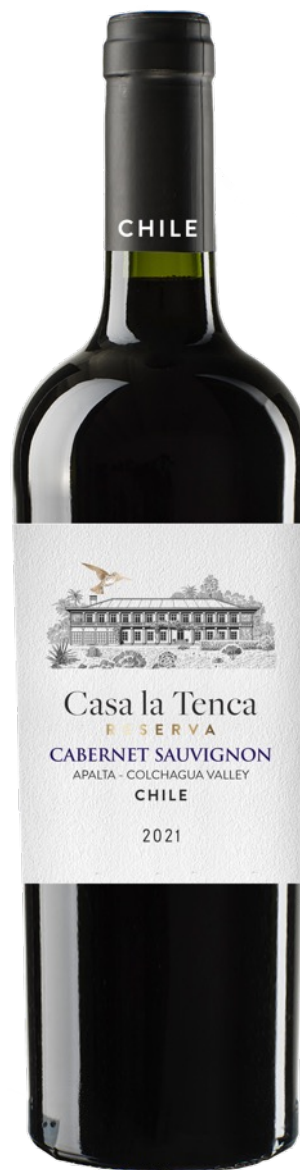
Casa La Tenca Cabernet Sauvignon