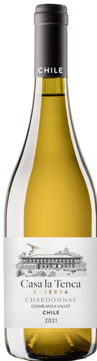
Casa La Tenca Chardonnay