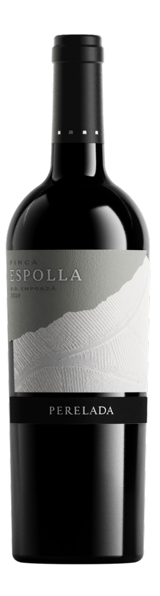
Perelada Finca Espolla