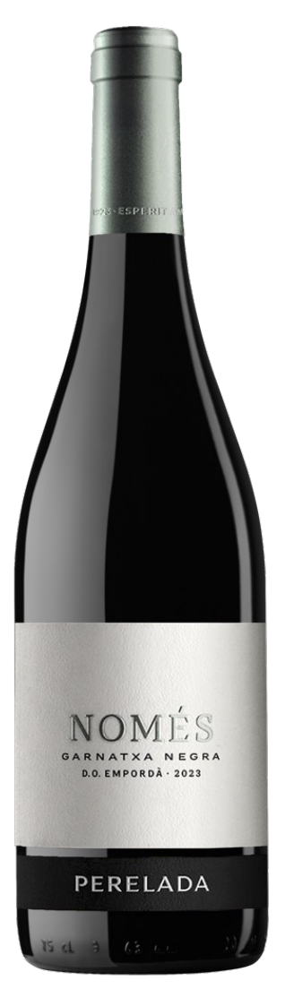
2 FINQUES PERELADA