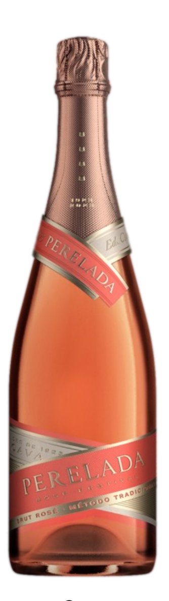
Cava Brut Rosé