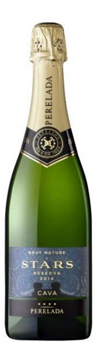
Stars Brut Nature Reserva