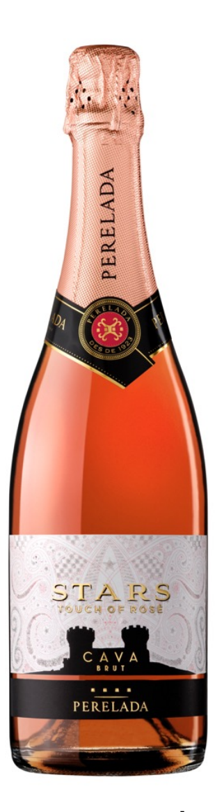
Stars Touch of Rosé