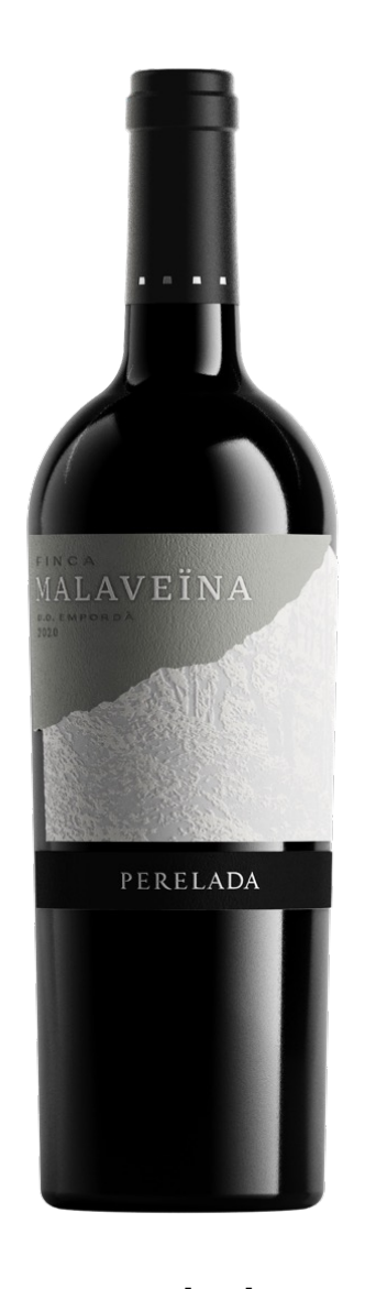
Perelada Finca Malaveïna