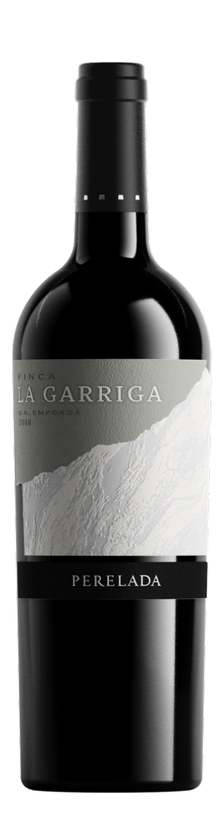
Perelada La Garriga