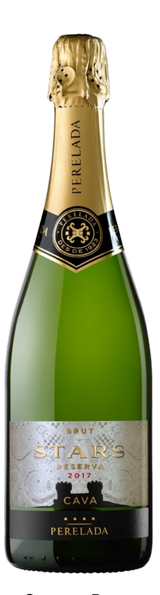
Stars Brut Reserva