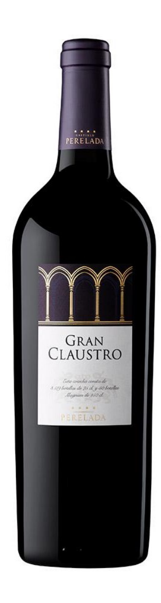
Perelada Gran Claustro