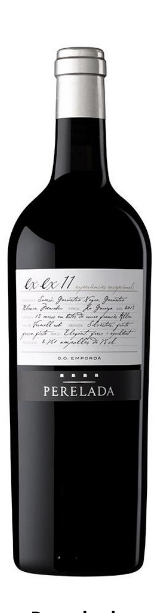
Perelada Ex Ex 11