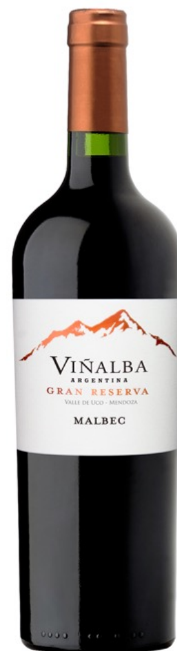
Gran Reserva Malbec