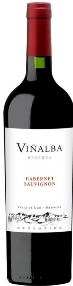
Reserva Cabernet Sauvignon