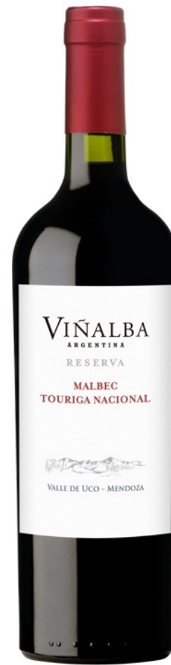
Reserva Malbec Touriga Nacional