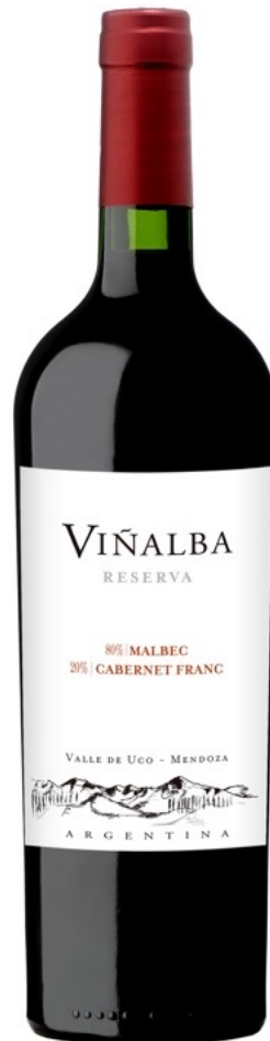
Reserva Malbec Cabernet Franc