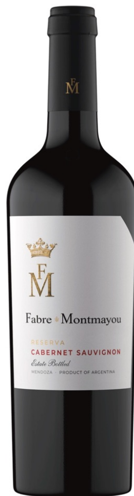
Reserva Cabernet Sauvignon