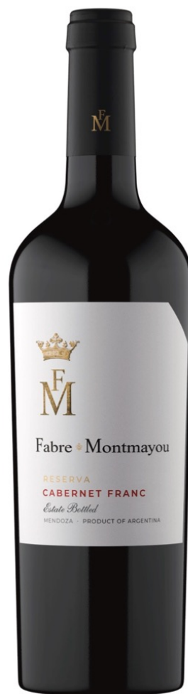
Reserva Cabernet Franc