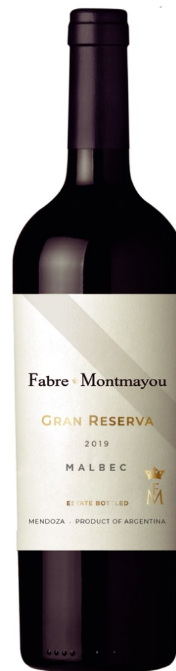
Gran Reserva Malbec