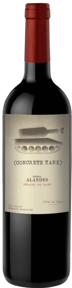
Alandes Concrete Tank