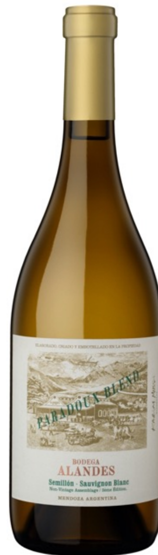
Alandes Paradox Blanc de Blancs