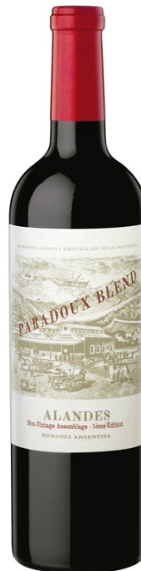
Alandes Paradox Red Blend