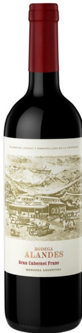
Alandes Gran Cabernet Franc