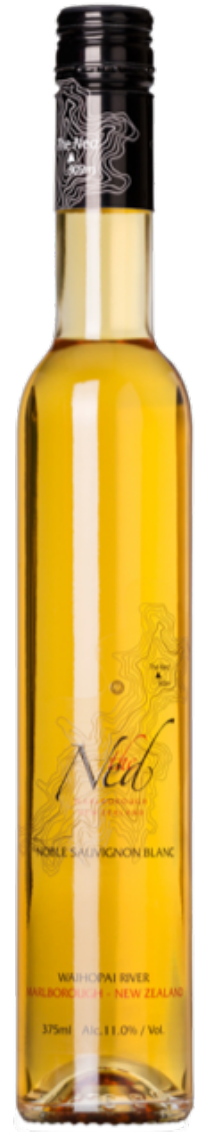
The Ned Late Harvest Sauvignon Blanc