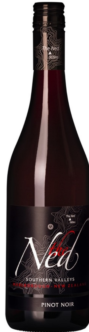
The Ned Pinot Noir