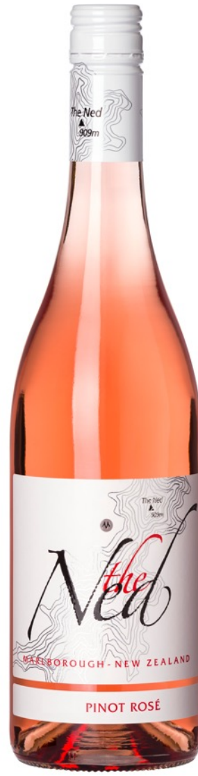
The Ned Pinot Rosé