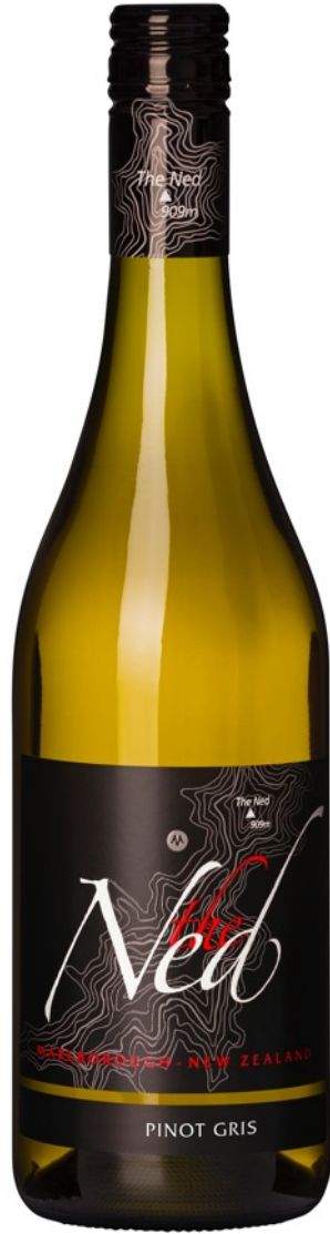
The Ned Pinot Gris