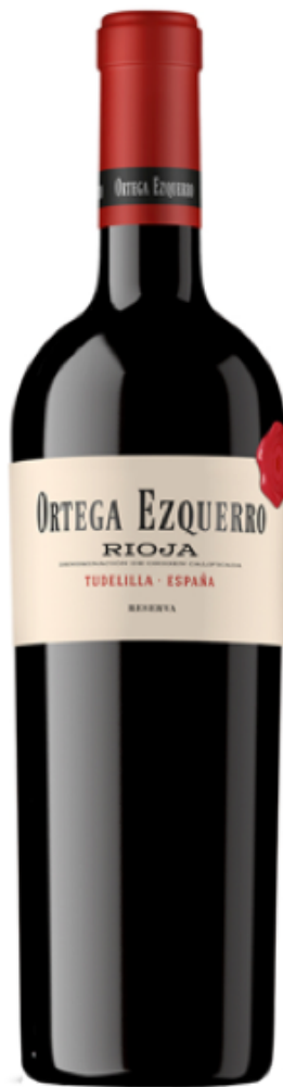
Ortega Ezquerro Reserva