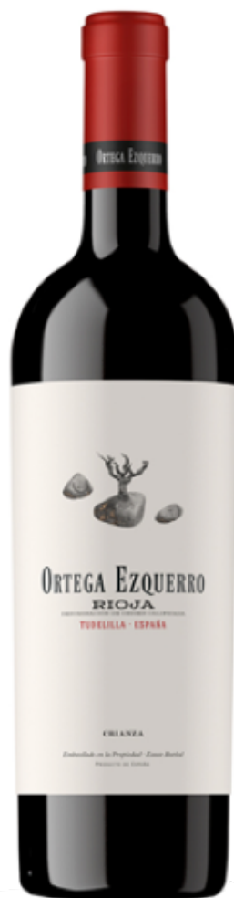
Ortega Ezquerro Crianza